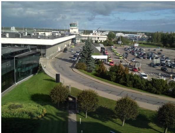
The Riga Airport

To reach her position, she got a degree in Public Relations.