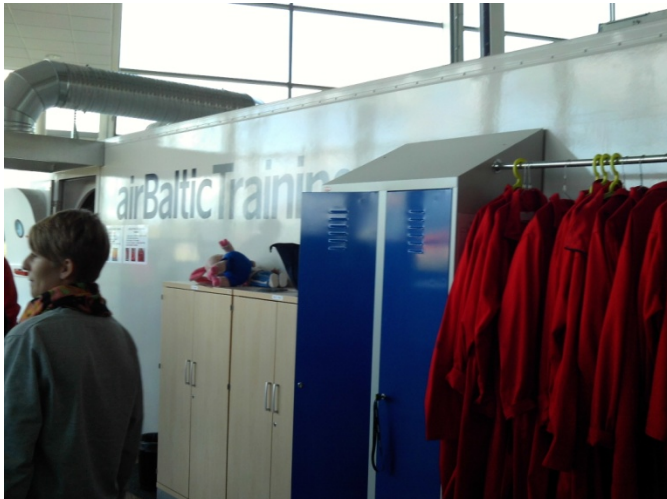
The plane simulator inside "AirBaltic" for the staff training