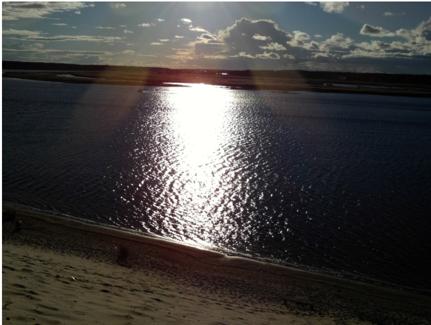
Some pictures of the seaside and the river of Jurmala