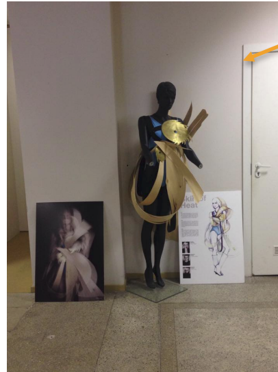
Lady Gaga's dress